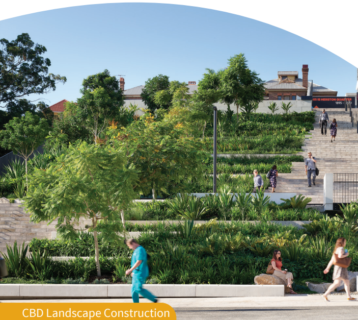
CBD Landscape Construction