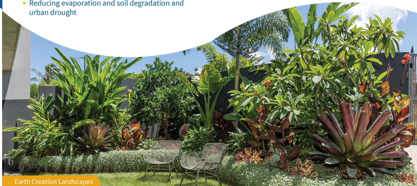
Earth Creation Landscapes