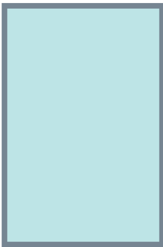
FULL PAGE 297mm (h) x 210mm (w)